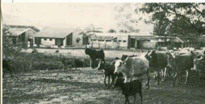
A quiet evening scene as goats and cows move slowly past the hospital at Udayagiri. (Photo : M. Philip, 1938)